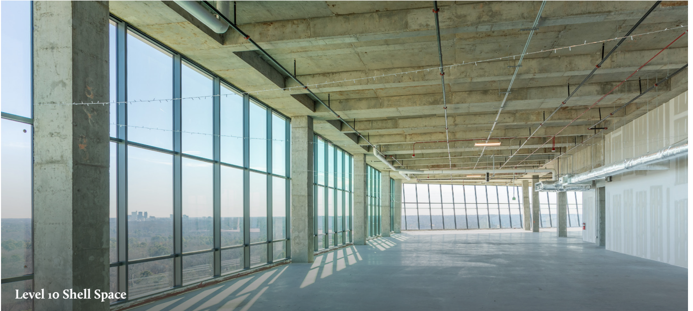
Level 10 Shell Space